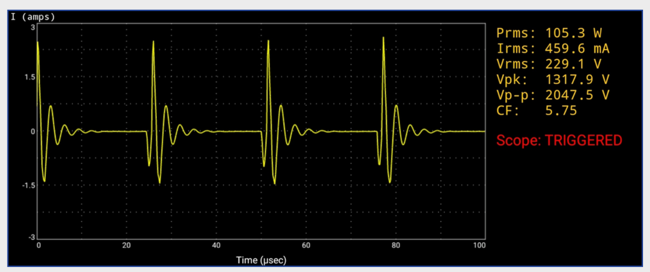
Figure 3: Screenshot of vPad-RF app displaying an ESU waveform.

On the vPad-RF display captured below, we can easily see that the ESU waveform is asymmetric and, as expected, the Vpeak measurement does not correspond to half of the Vpeak-to-peak value.