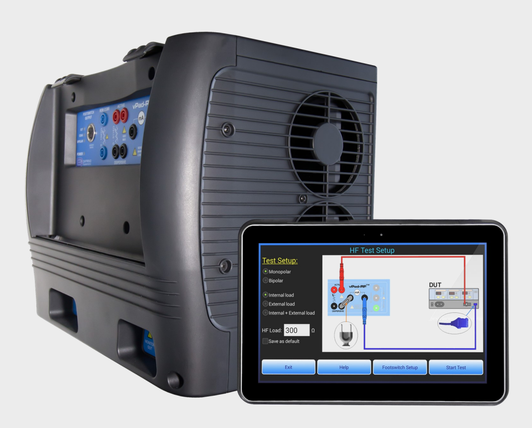
vPad-RF is the complete ESU Analyser!

vPad-RF is just one of the modern analysers available from Datrend Systems, contact us at <a href="mailto:Sales@Datrend.com">Sales@Datrend.com</a> to learn more about our full-line of Biomedical Test Instrumentation and Solutions.