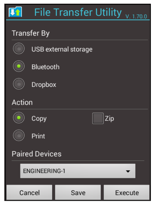
Figure 3 - File Transfer Options

If " File Output " is pressed, the selected file(s) will be converted and then sent to one of the destinations available in the File Transfer screen. If already in the MUP, XML or CSV folder, there will be no conversion, the selected file(s) will simply be transferred to the selected destination.