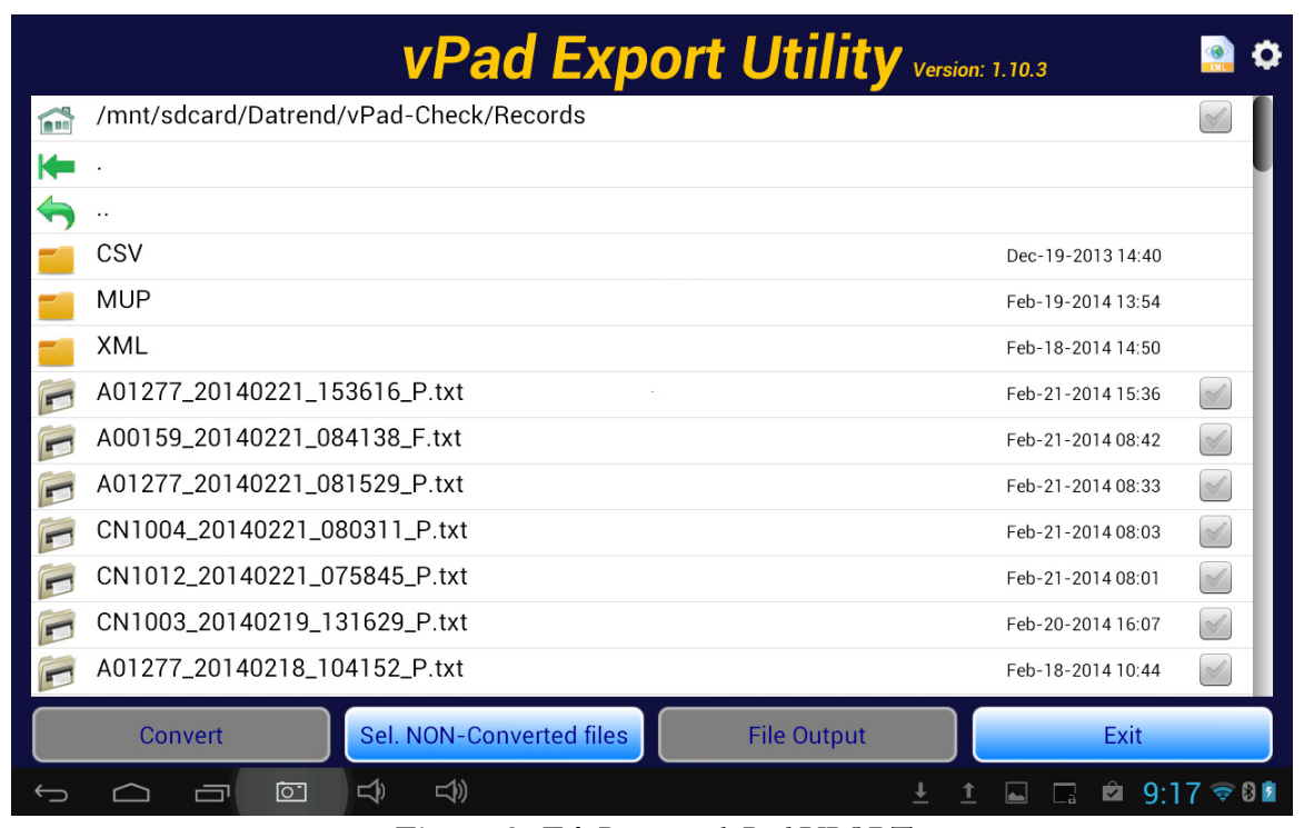
Figure 2 - File Browser of vPad-XPORT.

Following a successful start-up, vPad-XPORT will display the main menu of the App: