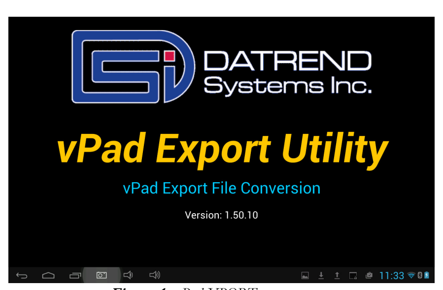
Figure 1 - vPad-XPORT startup screen.

Press the vPad-XPORT icon, to start the App. A splash screen will display the product name and the software version.